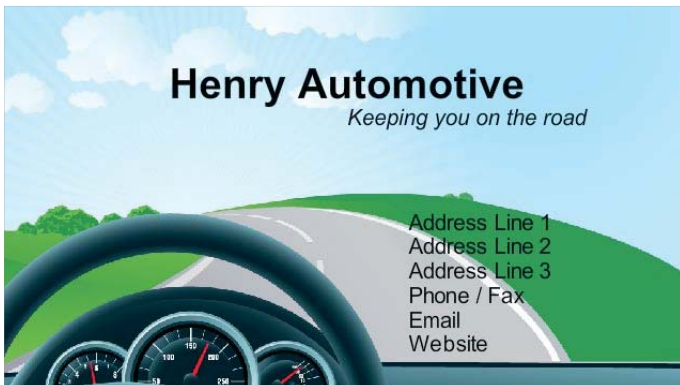
Didn't fully change the template information.