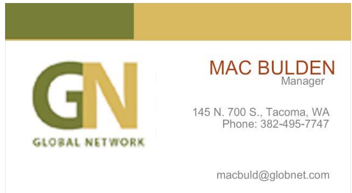
Pixelated (raster not vector) art used for logo (fuzzy after resized).