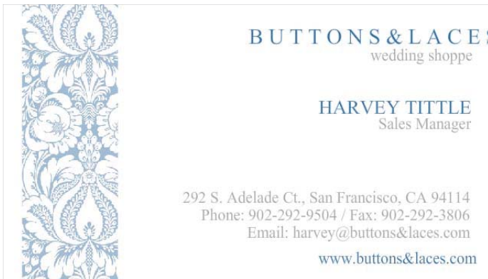
Text outside the safe margin.

The following examples are of common business card mistakes, though the problems illustrated can apply to any online printing project.