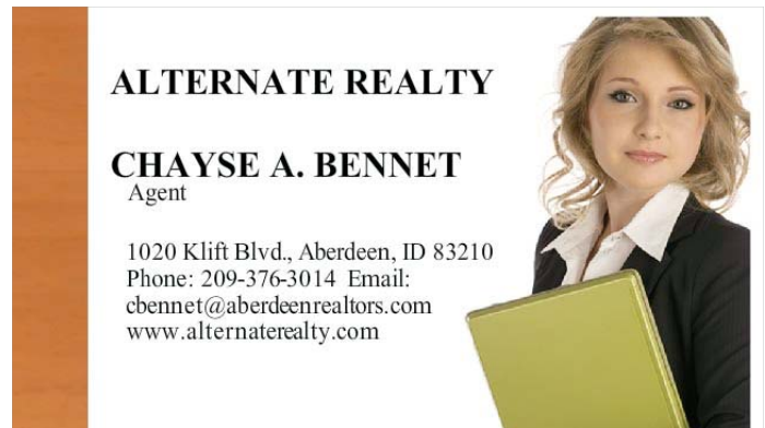
Didn't use full bleed on image, so edges (top and right) are blank.